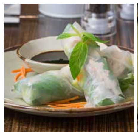
Below L-R: Rice Paper Rolls, Whole Foods Tasting Plate, Make Your Own Tacos.

Kids select their preferred drink from the options above.